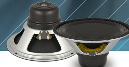
// ASCENSION A90