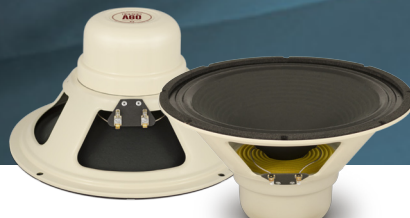
// ASCENSION A60