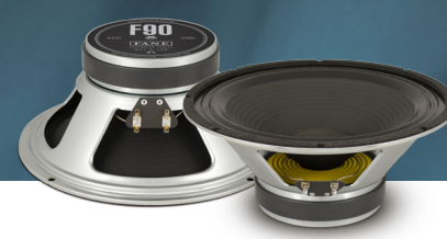
// ASCENSION F90