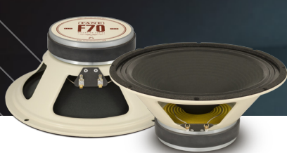
// ASCENSION F70